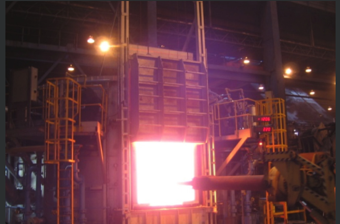
Fig. 3 Rotary hearth furnace being charged.