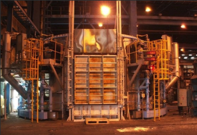
Fig. 2 Rotary hearth furnace with the door closed.